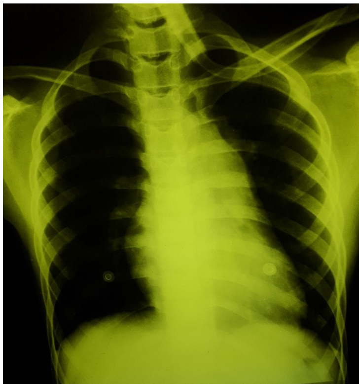
Figure 1. Chest X-ray revealing cardiomegaly, decreased pulmonary vascular marking, and prominent Main pulmonary artery silhouette

Familial pulmonary arterial hypertension is a serious disease with the consequences of recurrent syncope and right heart dysfunction. Although there were re-