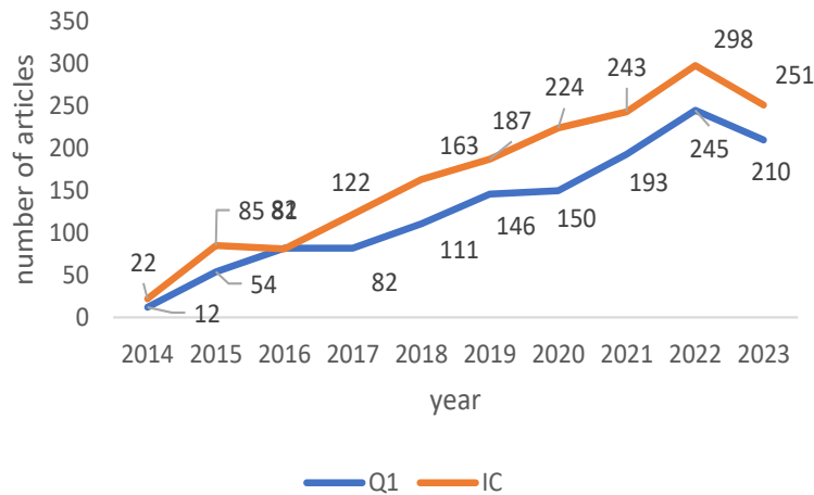
Figure 2. The number of articles published by PRCs in Q1 Journals and with international cooperation (2014-2023)