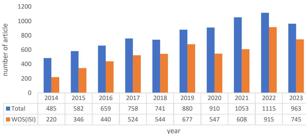
Figure 1. The number of articles published by Iranian PRCs (2014-2023)