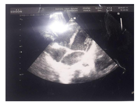
Journal of Pediatrics Review

case reports in the world and the first in Iran. There have been previous reports of MMSDH without cardiac disease. In the present study, the boy had no symptoms of vomiting, ketoacidosis, developmental delay, and malformation except for cardiac disease, unlike other reported cases in the world.