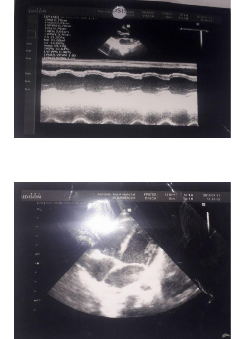
Figure 1. Echocardiography of case MMSDH

Finally, the blood sample was sent to CENTOGENE (a genetic diagnostic laboratory located in Germany) for genetic analysis and final confirmation of the disease. Then, his genetic mutation was reported c.184 c>G and gene analysis for ALDH6A1 gene, c.184c>G (p.Pro62Ala) was done. Thus, MMSDHD was genetically confirmed (Table 1). After treatment with specific drugs such as milrinone and dopamine, the EF reached 45% and the patient was discharged.