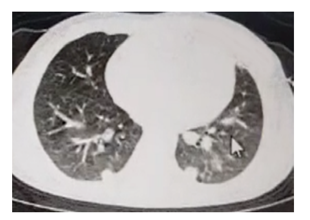
Figure 4. Second chest CT scan findings

A limited body of knowledge is available about the lung manifestations of COVID-19 in children. Recent studies have suggested that COVID-19 pneumonia is mainly mild in children and has a good prognosis in those with no underlying diseases (2, 11). Chest CT scan in infected children can present characteristic changes of sub-pleural GGOs and consolidations with the surrounding halo, which is a suitable index for following up and evaluating the changes of lung lesions (2).