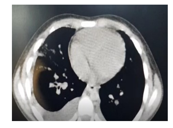
Figure 3. First chest CT scan findings

Lung ultrasound in COVID-19 patients revealed a different pattern of lung involvement. Vertical artifacts (70%), pleural irregularities (60%), white lung areas (10%), and sub-pleural consolidations (10%) were the main findings in patients with COVID-19, although there were no cases of pleural effusions (3). However, Ahmadinejad et al. reported a 59-year-old patient who complained of fever, dry cough, and dyspnea with massive pleural effusions, which was reported positive for COVID-19 (5).