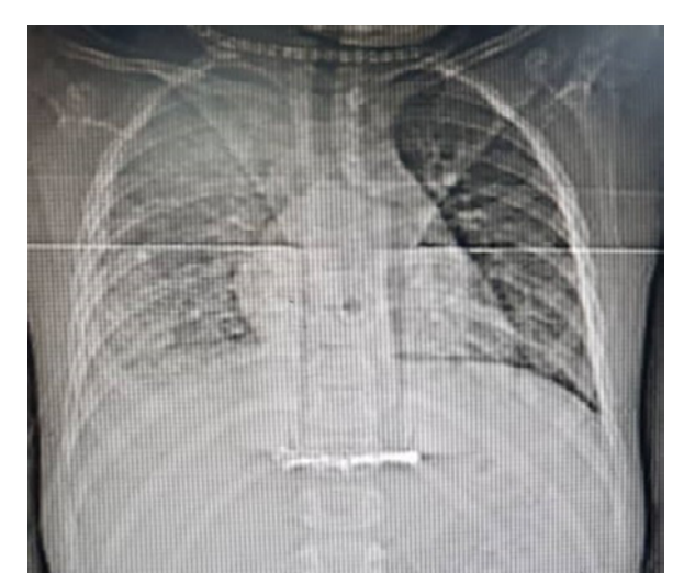
Figure 2. Topogram of the first chest CT Scan

Chest CT scan has a high sensitivity for the diagnosis of COVID-19 and may be considered a primary tool for diagnosing COVID-19 in epidemic areas (6). Adam et al. suggested that bilateral and peripheral ground-glass and consolidative pulmonary opacities in the chest CT scan are the hallmarks of COVID-19 (7). Likewise, Zhou S et al. reported that the identification of GGO and a single lesion on the initial CT scan suggested early-phase disease (8). Thus, patients with fever and cough symptoms and GGO lesions on chest CT scan, with a standard or decreased range of white blood cells and a history of epidemic exposure, are highly suspected of having COVID-19 (9).