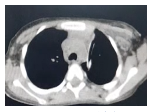
Journal of Pediatrics Review