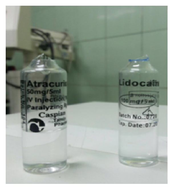
Journal of Pediatrics Review

Figure 2. Two vials of lidocaine and atracurium with the same shape and color