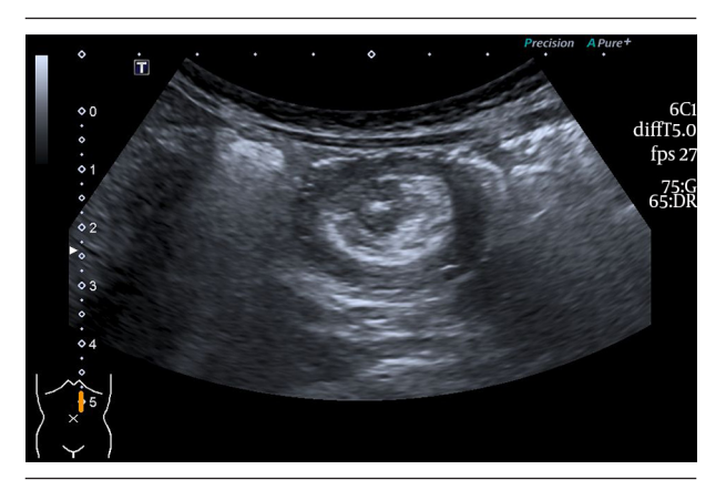
Figure 1. Abdominal Ultrasound on Admission

was no further gastrointestinal bleeding, the parents soon noticed significantly increased alertness and physical activity, and the stoma was reversed 7 weeks later.