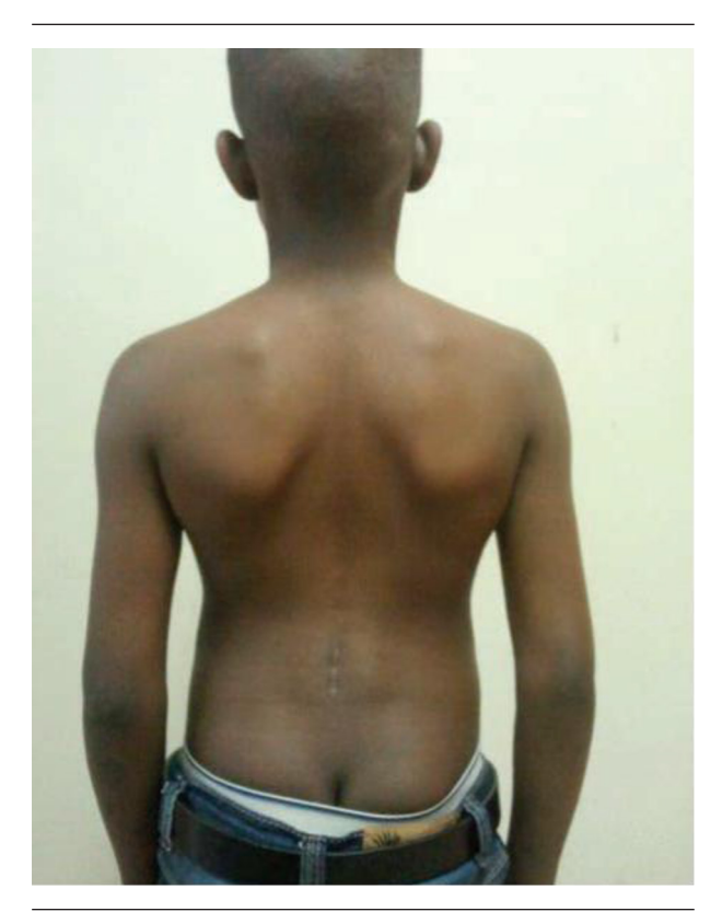
Figure 3. Twelve Weeks Postoperation Demonstrating Resolved Listing and a Normal Lumbar Lordosis