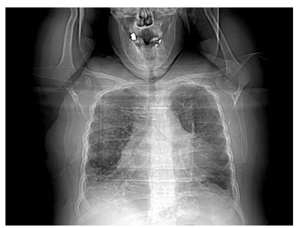
Journal of Pediatrics Review