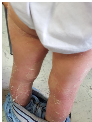
Figure 2. Ichthyosis linearis circumflexa (ILC) on antecubital (2a) and popliteal area (2b)